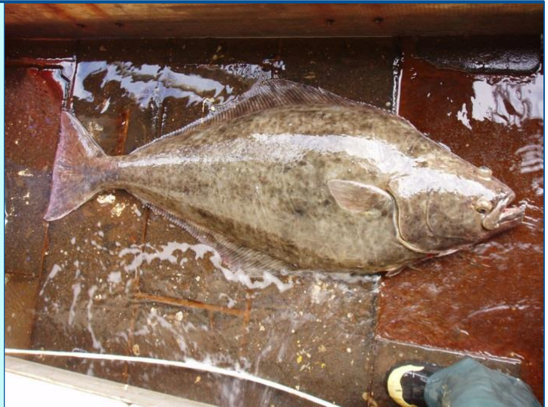
40 lb halibut ( Hippoglossus hippoglossus ) caught during 2009 monkfish survey cruise.